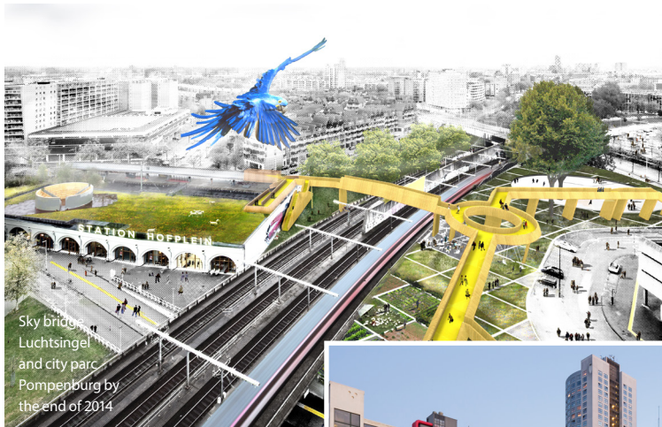
Sky bridge, Luchtsingel and city park Pompenburg by the end of 2014