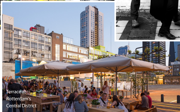
Terrace at Rotterdam's Central District