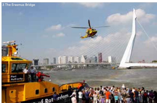
3 The Erasmus Bridge

discovery with a tour of the harbour on a Spido boat and a visit during September's World Port Days. 'For three days, you get the opportunity to visit places in the port that you normally would never get access to. There are excursions, such as tours to the Maasvlakte I and II sites and the FutureLand Information Centre, but also plenty of entertainment near the Erasmus Bridge!'