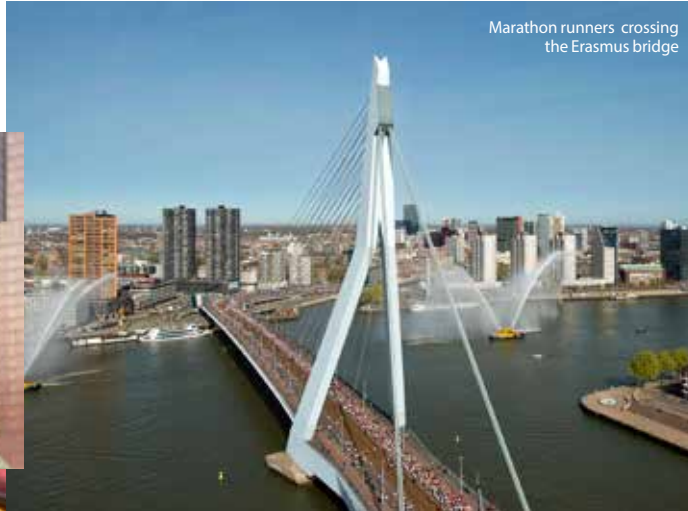
Marathon runners crossing the Erasmus bridge