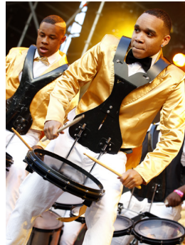
Clockwise from top: Summer Carnival Street Parade, Battle of Drums, Concert at Hofplein