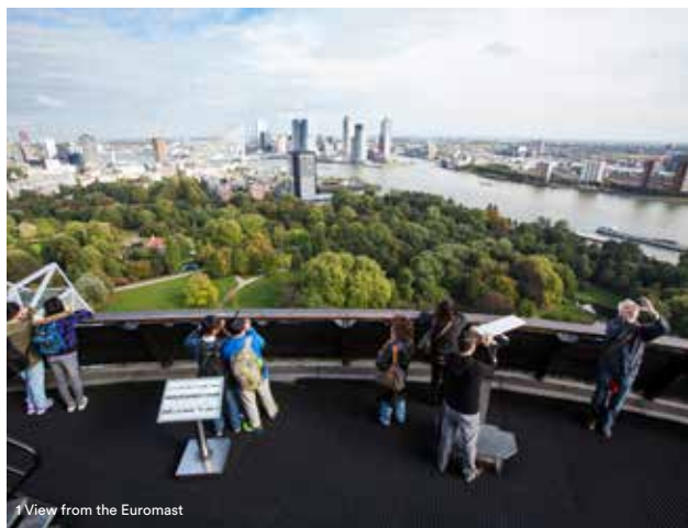
1 View from the Euromast

The port of Rotterdam is not only a significant driver for the Dutch economy, it is also a place of inspiring beauty. What should you not miss when you visit the port of Rotterdam? We asked Zekiye Yilmaz, the 2013 winner of the port's Young Port Talent competition.